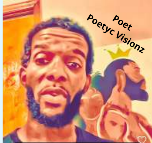
Poet Poetyc Visionz

Follow Poetyc Visionz on instagram at @poetyc_visionz